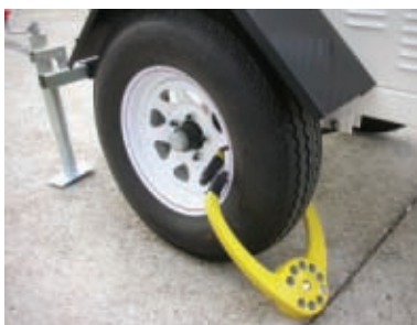
Tire Clamps For Added Security