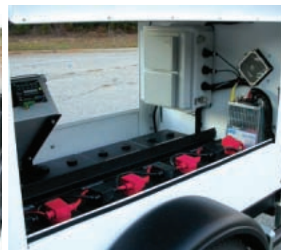
Long Battery Life