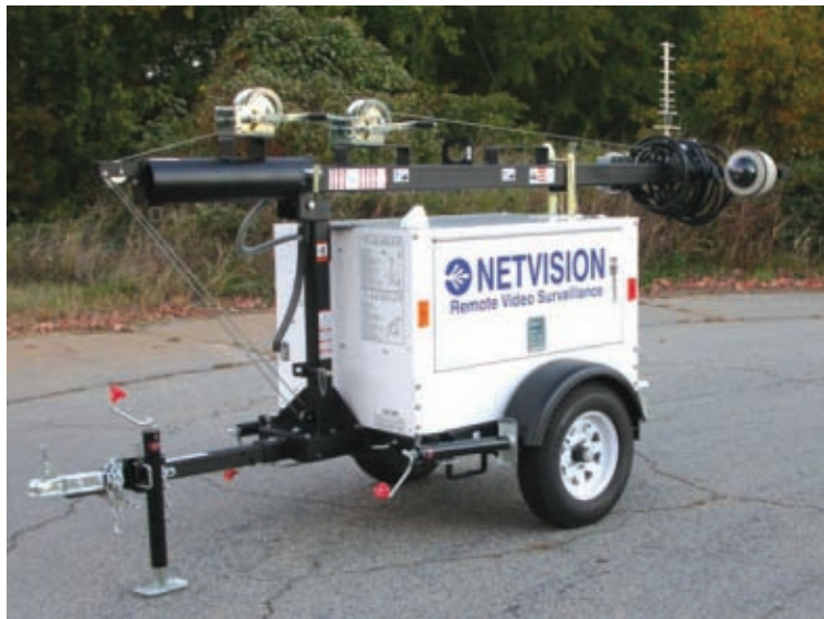
Convenient Rapid Deployment